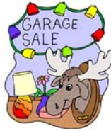
Table rental forms are available in the social hall. You keep the money from your sales; the youth group keeps the proceeds from the table rentals. Proceeds go to the DYC and St. Vincent De Paul.